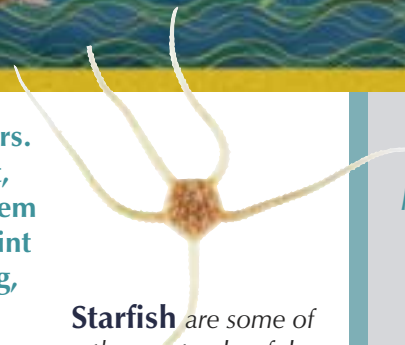
Starfish are some of the most colourful LOWLIFE in Antarctic waters.

Low Life MENU Phytoplankton focaccia Krill crackers Squid soup