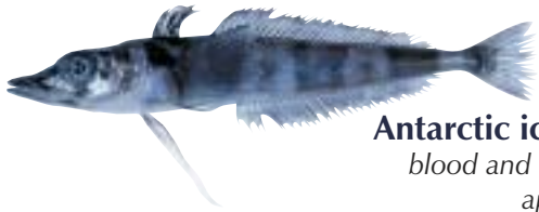
Antarctic ice fish have colourless blood and have a ghostly white appearance.

There are about 120 fish species known to live in Antarctic waters. They show some remarkable adaptations to their environment, including proteins in their blood that act as antifreeze to help them survive in the icy waters. The 'antifreeze' lowers the freezing point of their body fluids to about minus 2°C and stops them freezing, even when water temperatures are below zero.