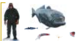
SIZING UP THE SUSPECTS