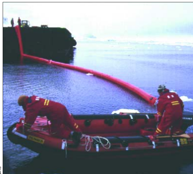
Oil spill response exercises are carried out regularly at Rothera Research Station as required by the Environmental Protocol

world. The regulations are mandatory and are legally binding on all the Treaty nations. Never before have nations agreed such detailed rules to protect the environment of a whole continent.