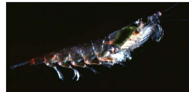
Krill are a key species in the South Ocean food chain. Harvesting is strictly controlled by CCAMLR

CCAMLR, with its proactive rather than reactive approach, entered into force in 1982. Unfortunately, this was about a decade after fishing began in the Southern Oceans and the Convention inherited some seriously depleted fish stocks. However, progress has been made since then. Regulatory measures, including catch limits, have been set for all commercial fisheries and strict controls introduced to minimise illegal and unregulated fishing activity.