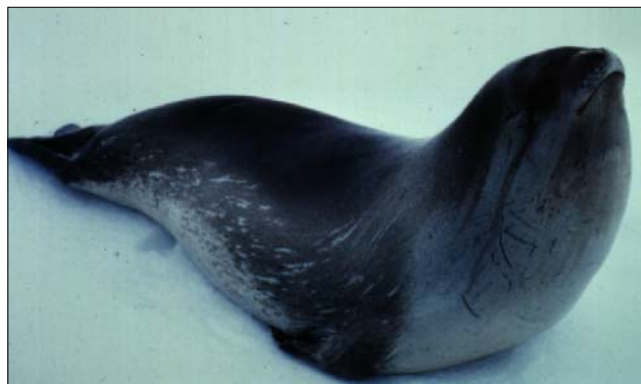
The killing of Ross seals is prohibited by CCAS