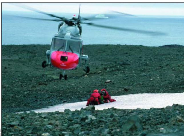
Under the Agreed Measures flying helicopters in a way that disturbs birds and seal colonies is prohibited

The Agreed Measures have now been superseded and brought up-to-date by the Environmental Protocol.