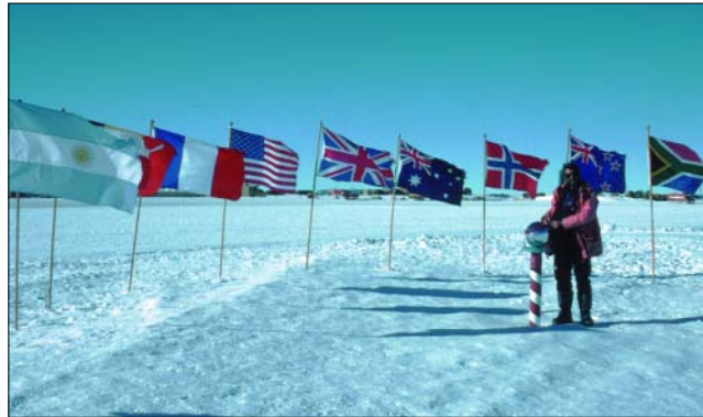
The geographical South Pole with the flags of the Antarctic Treaty nations around it

Task 2 Examine the map and the history of the territorial claims in Antarctica which are shown in Resource ATS1. Which countries have claims? For each country suggest reasons for its claims. Reference to a map of the southern hemisphere will assist you in this. ➤